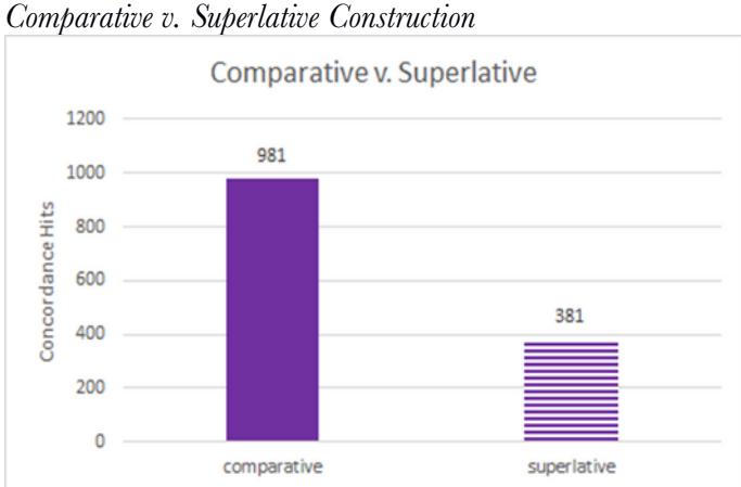
Figure 3 Combarative v. Suberlative Construction

Figure 3 displays the overall frequency of comparative and superlative constructions in the text.