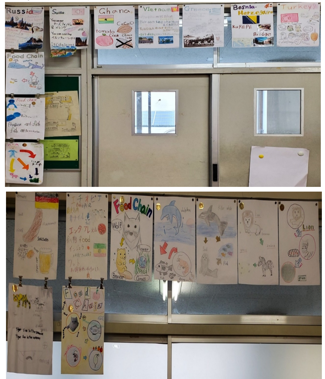
Figure 3 Fun Essay Posters on Classroom Walls: Favorite Countres and Food Chains