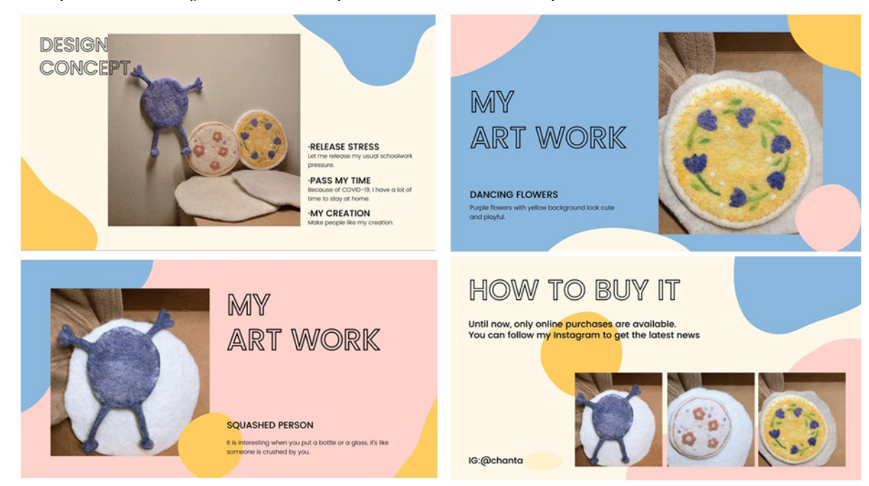
Appendix B A sample of ESP Projects to sell and promote student-made products.