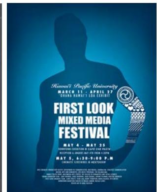
Previous First Look Mixed Media Festival POSTER Winners