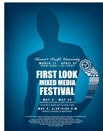
Previous First Look Mixed Media Festival POSTER Winners