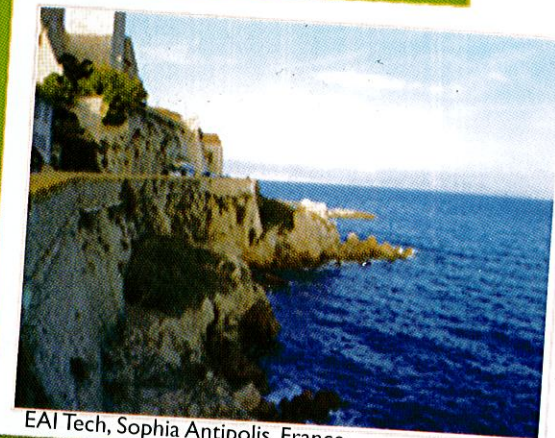
EAI Tech, Sophia Antipolis, France

Hawaii Pacific University International Center 1164 Bishop Street, Suite 1100 Honolulu, Hawaii 96813-2882 Telephone: (808) 544-0811 Fax (808) 543 8065