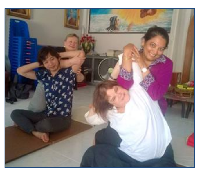
DAY 6: HIV AND AIDS IN THAILAND

not be mistaken as simply something done to relieve muscle aches after a long week of work, but rather is an essential ingredient in maintaining holistic health that should be practiced regularly to ensure that our body and mind are free from disorder and misalignment. This was my first time to receive a professional massage, and it was life changing. I now receive a Thai massage at least once a month. Unfortunately, it's far more expensive here in the US (about $60-90 per hour), and is rarely covered by our health insurance.